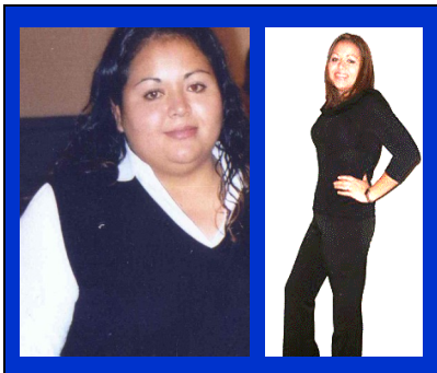
She lost 110 pounds in 8 months!