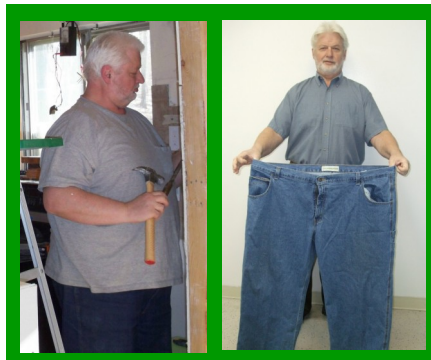
He lost 106 pounds in 5 months on the WOW Diet!