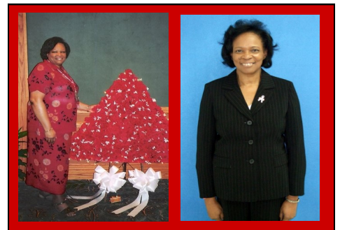
She lost over 85 pounds in 8 months

321 S. Patrick St, Alex, VA 1860 Town Center Dr, Reston, VA 703-549-2626 703-925-9800